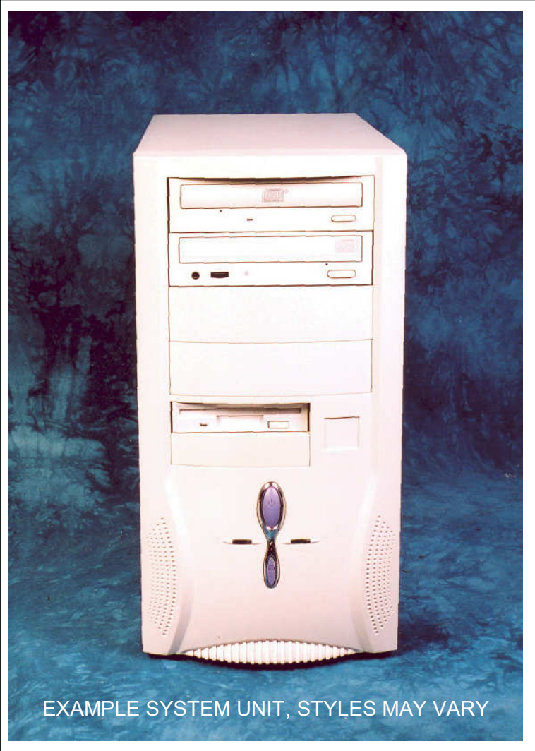
EXAMPLE SYSTEM UNIT, STYLES MAY VARY